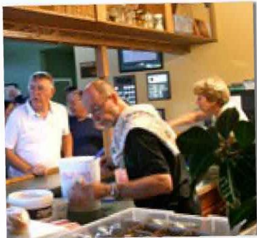
SCOOPING OUT ICE CREAM

Photographs taken at barbecue on August 12th.