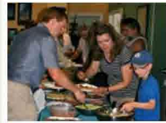
POT LUCK DINNER