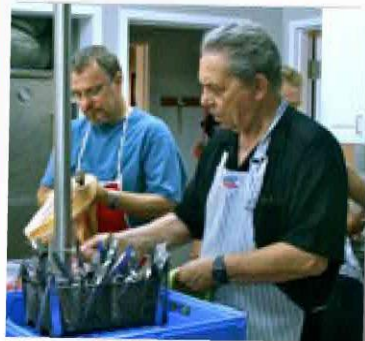
CLEAN UP CREW