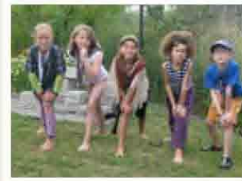
FUN & GAMES