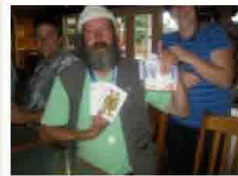
WINNING POKER HAND